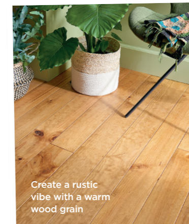
Create a rustic vibe with a warm wood grain

Introducing a different flooring can help separate a space visually, but also works well on a practical level, too. Tiles are a hard-wearing option for busy kitchen areas and are easy to clean so spills aren't an issue, either. Tiles are a hard-wearing option for busy kitchen areas and are easy to clean so spills aren't an issue, either. Tiles are a hard-wearing option for busy kitchen areas and are easy to clean so spills aren't an issue, either. Tiles are a hard-wearing option for busy kitchen areas and are easy to clean so spills aren't an issue, either.