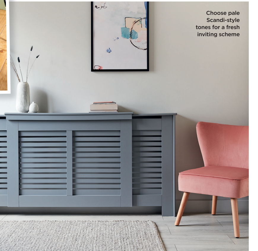
Choose pale Scandi-style tones for a fresh inviting scheme