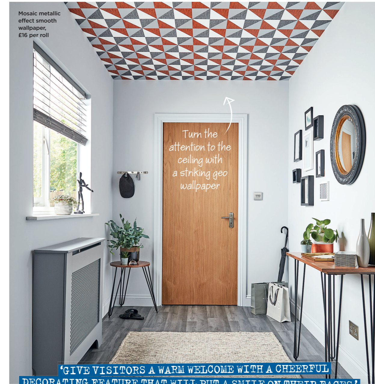
Mosaic metallic effect smooth wallpaper, £16 per roll

*WE ARE UNABLE TO SCAN ANYTHING THAT'S TOO SHINY, DOESN'T PROVIDE A SOLID ENOUGH COLOUR TO MATCH OR IS SMALLER THAN 1 INCH SQ.